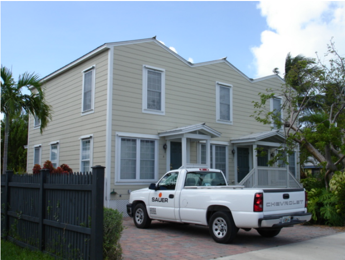
1818 Fogarty Avenue